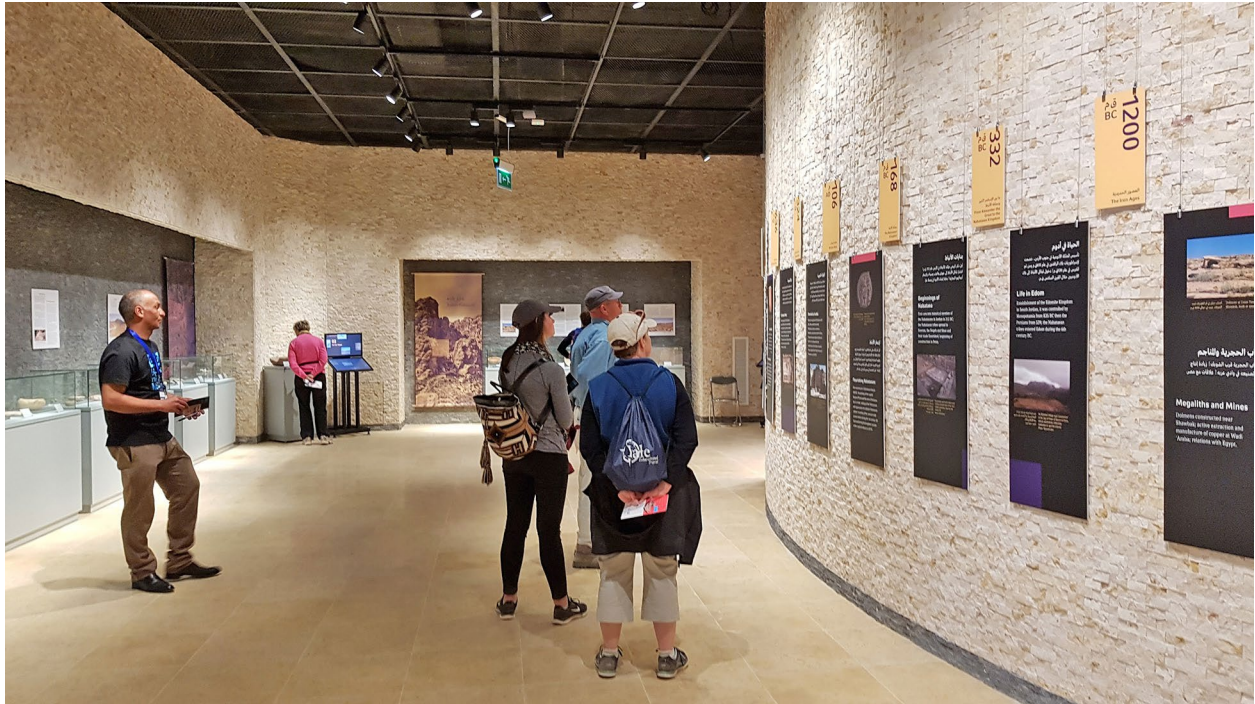
FIG. 2. “Foundations of Petra” gallery with visitors and museum staff member.