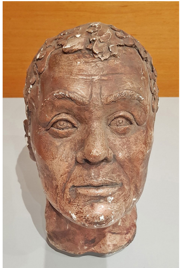
FIG. 3. Facial reconstruction from the skull of a middle-aged male found in the Window Tomb under the Khazna (the Treasury) in Petra.