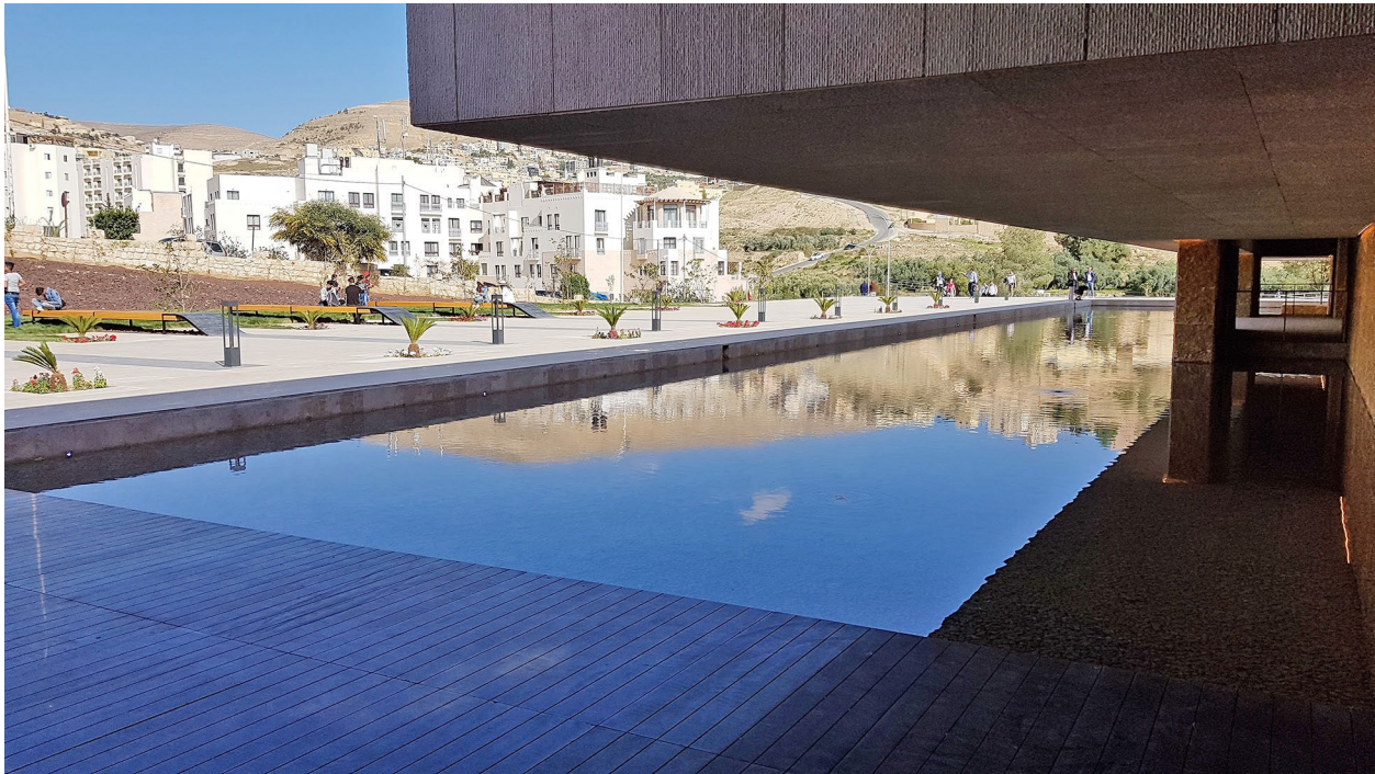
FIG. 1. Exterior of the Petra Museum, Wadi Musa, featuring shallow ornamental pool.

Images are not edited by the AJA to the same level as those in the printed article.