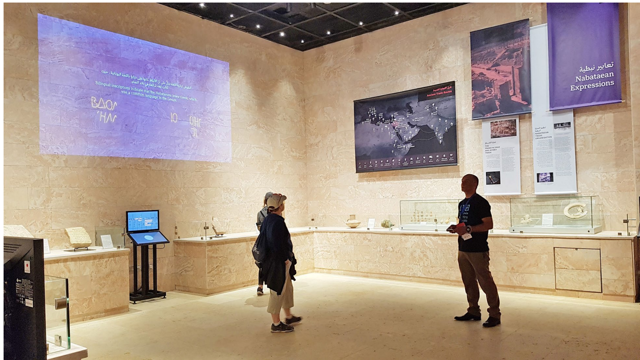
FIG. 4. “Nabataean Expressions” gallery.